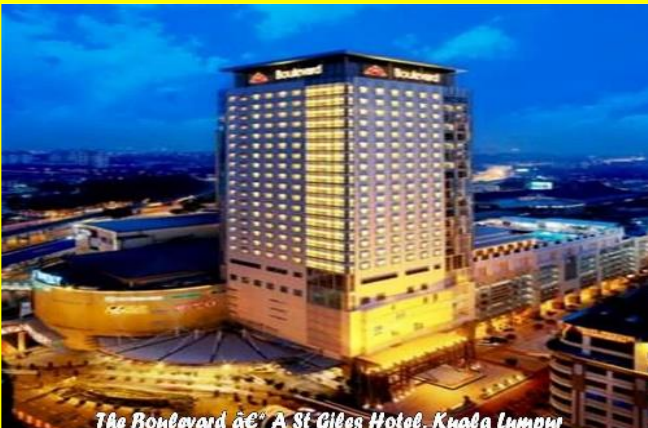
The Boulevard @ A S E Hotel, Kuala Lumpur